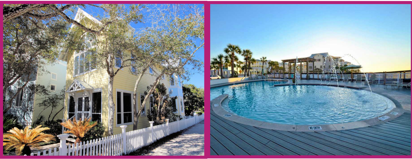
Also up for bids this one week stay at Seaside, a Gulf-front community in Florida. This is where the movie "The Truman Show" was filmed!