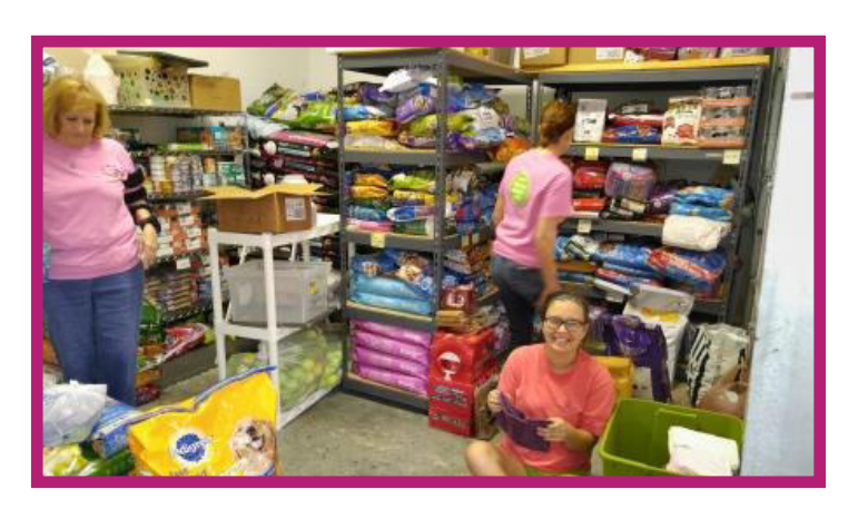
Pet Food Pantry Volunteers in action

Shelter Cleaning Team Central to the success of SAFE Haven for Cats is the cleanliness and upkeep of the shelter, and this cannot be done without the volunteers who come in daily to tidy up. The shelter cleaning team members scoop litter boxes, change linens and toys, fill water bowls, and sweep the floor. Some cleaning team members focus on laundry and dishes as well. Cleaning team members can also play and socialize with the cats at the end of their shift.