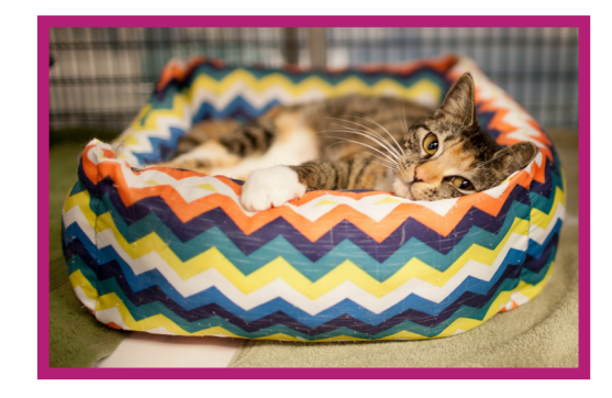
Salsa is a 2 year old female Torti Tabby Tux

Salsa is such a well-adjusted perfect cat. She loves to be petted and is easy to pick up and hold. She loves playing with balls and catnip mice and enjoys stalking and jumping on them. She is great with everyone including dogs, other cats and children. What's not to love about this lovely cat who came to us from the Franklin County Animal Shelter.