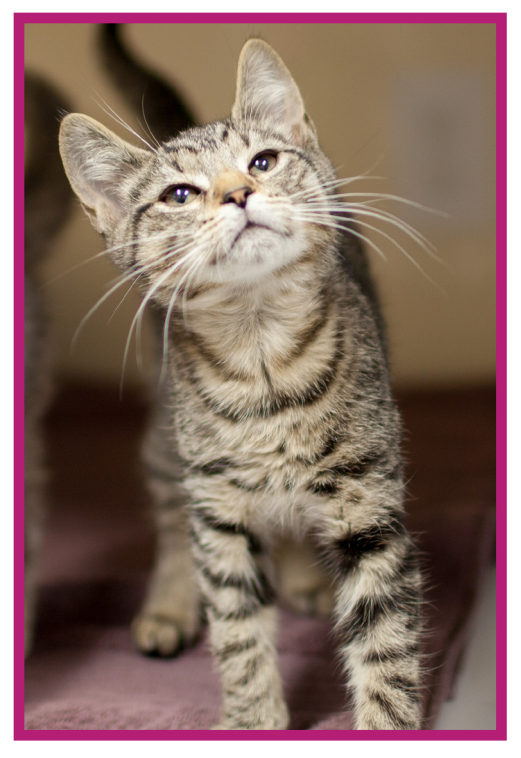
Ewok is a 5 month old male