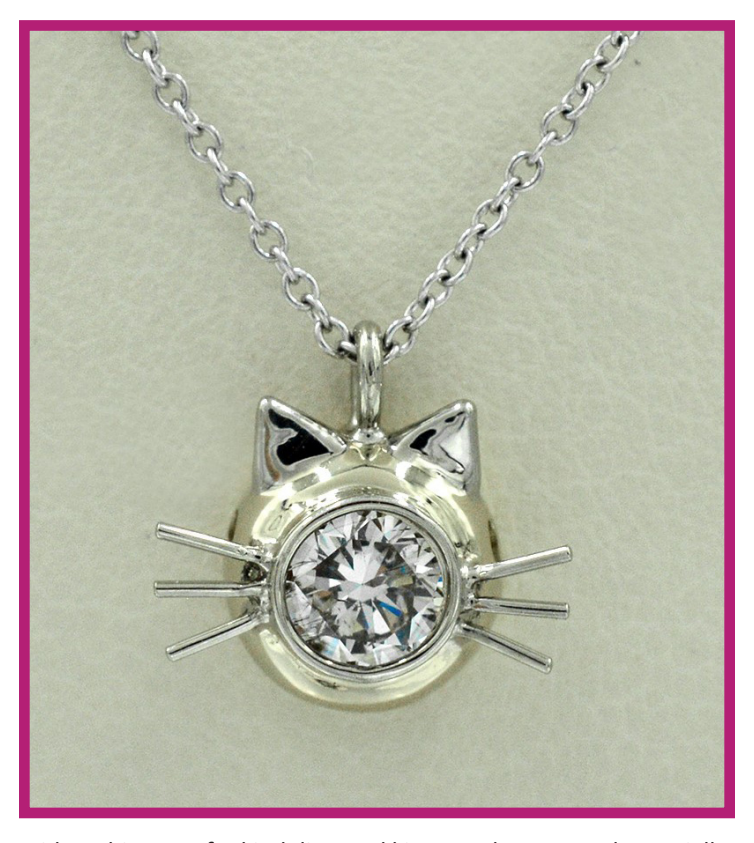
Bid on this one-of-a-kind diamond kitty pendant created especially for the Ball by Raleigh Diamond.