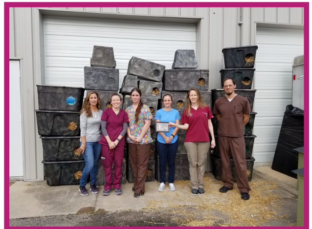
Making Feral Cat Houses – Project Julius

Central to the success of SAFE Haven for Cats is the cleanliness and upkeep of the shelter, and this cannot be done without the volunteers who come in daily to tidy up. The shelter cleaning team members scoop litter boxes, change linens and toys, fill water bowls, and sweep the floor. Some cleaning team members focus on laundry and dishes as well. Cleaning team members can also play and socialize with the cats at the end of their shift.