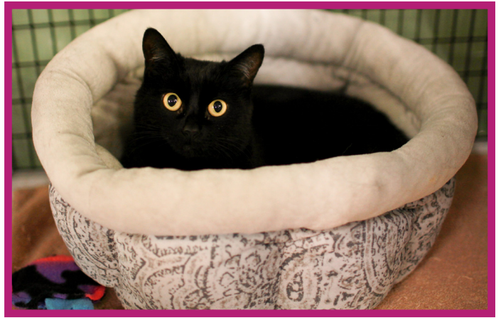
Sparkleberry is a 6 year old female cat

Sparkle (as her former adopter called her) was adopted from SAFE Haven 4 years ago. Her owner could no longer keep her so she was returned to us. She loves to sleep on the bed with her humans, HATES dogs, is sweet, and nervous sometimes. (This actually describes some people I know!) Our Happy Cats group of volunteers is working with her and reporting a lot of progress in her becoming more confident and enjoying touch, a predictable schedule, and yummy treats. (Again, like a lot of people I know!). Surely, there is a loving person in our community who could love her back.