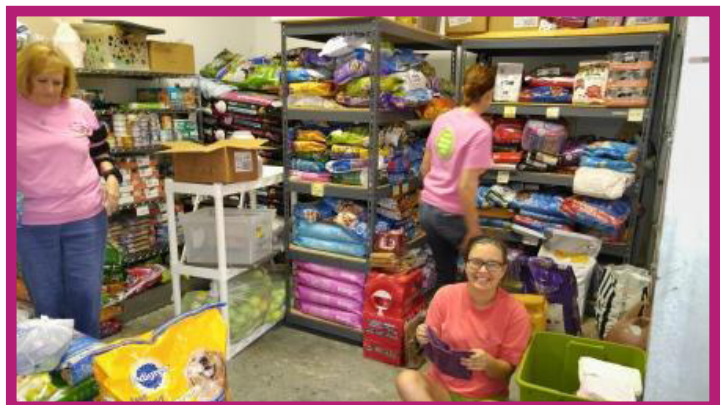
Pet Food Pantry Volunteers in action