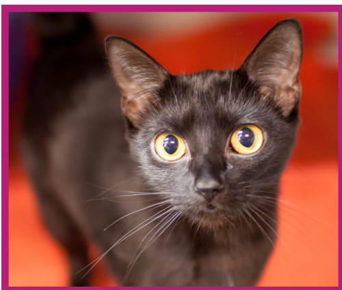
Mistra is a year and a half year old female

Mistra is a young cat who is lucky to have been found as a stray and brought to our good friends at the Wake Country Adoption Center. They told us about her and we were delighted to bring her to SAFE Haven. The most striking thing about Mistra is her huge gold eyes, large ears and sleek, shiny fur. She has the longest legs and tiny feet. If she had her DNA done we are sure there would be some Siamese in her lineage.