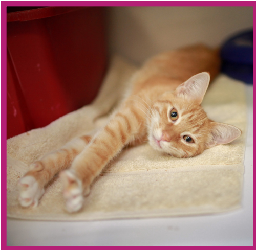
Quatrain is a nine month old male teenager

Quatrain came to SAFE Haven from one of our partnering county shelters. During his initial exam, he was unable to move his tail. After thorough examination, he was determined to have a “tail pull” injury. This type of injury occurs when a cat’s tail is jerked/pulled hard enough to dislocate the tail vertebrae. In some cases, it can lead to a complete loss of nerve function and significant urinary problems.