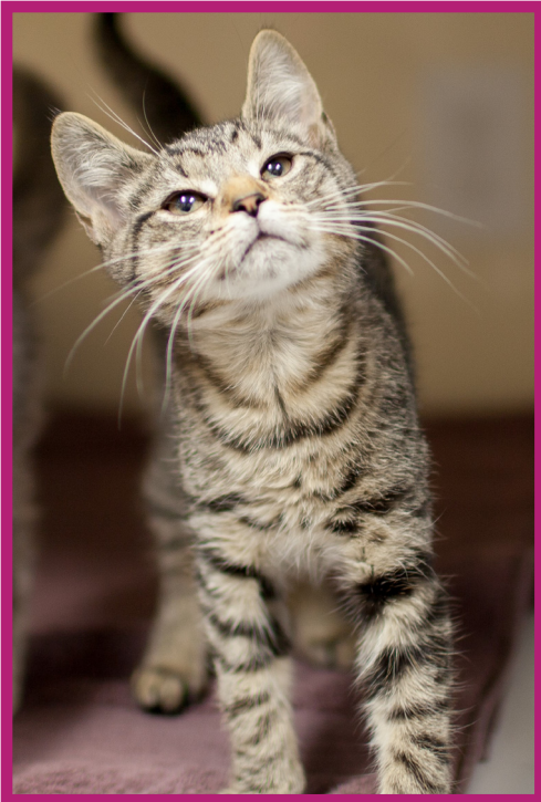
Ewok is a 5 month old male