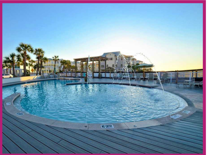
Also up for bids this one week stay at Seaside, a Gulf-front community in Florida. This is where the movie "The Truman Show" was filmed!