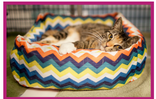
Salsa is a 2 year old female Torti Tabby Tux

Salsa is such a well-adjusted perfect cat. She loves to be petted and is easy to pick up and hold. She loves playing with balls and catnip mice and enjoys stalking and jumping on them. She is great with everyone including dogs, other cats and children. What’s not to love about this lovely cat who came to us from the Franklin County Animal Shelter.