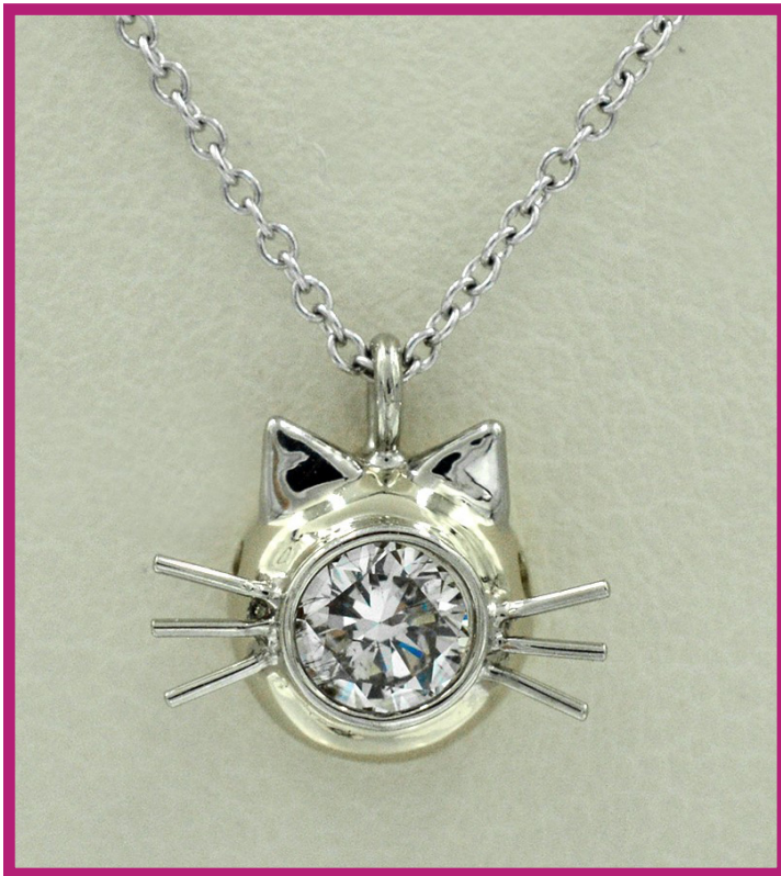
Bid on this one-of-a-kind diamond kitty pendant created especially for the Ball by Raleigh Diamond.