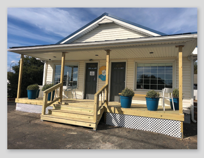
Purr Cup Café 210 Prospect Avenue, Raleigh

To book a visit with the cats call 919 322-4003 or visit Purrcupcafe.com